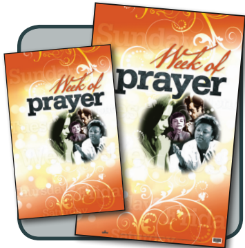
Week of Prayer Poster & Bulletin