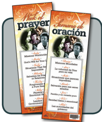
Week of Prayer Bookmark