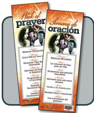
Week of Prayer Bookmark

Prepared by the Assemblies of God National Prayer Center www.prayer.ag.org